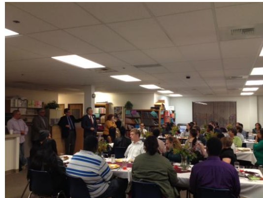
Elk Grove Officials welcome the students and thank Soroptimist.