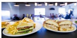
Lodi Airport Cafe

This month we will meet at Lodi Airport Cafe , at 23987 N. Highway 99, Acampo, at 11:30am, on September 10th. Here is their lunch menu .