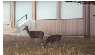
2 of the 5 Deer

She was also visited by the wildlife seen above. The Berry House in Sea Ranch is “white-water” rental home. It sits right above the cliffs.