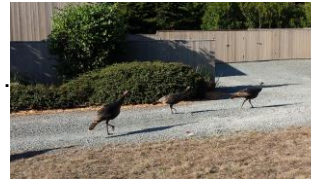
3 of the 11 Turkeys