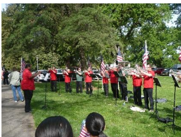
Freelancer's Alumni Band