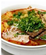
Loving Hut soup