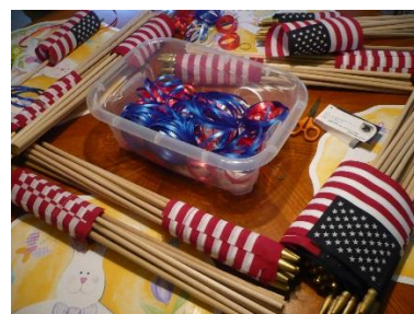
Flags and ribbons

We also have fun while we do this. Here are some pictures from last year's gathering: