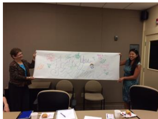
ILP Thank You Banner