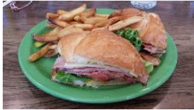
Ham & Cheese Croissant – Delicious!

This month there will be NO 2 nd Wednesday lunch. It was decided to skip it until next year as it would be so close to our party.