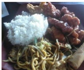
Golden Dragon lunch