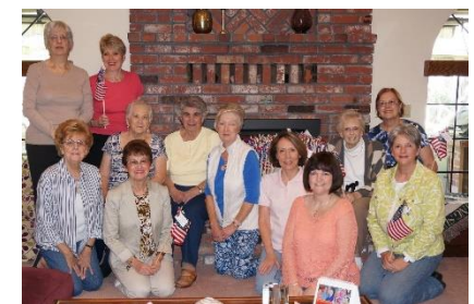
Flag Brigade 2

See you at the Walk to Remember on April 12 th !